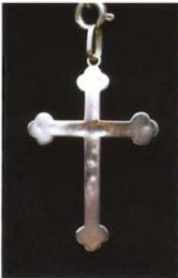
Colour plate 3 Vincent Sabini's crucifix made from the German bullet that wounded him on 7 June 1917 at Messines, Belgium (page 80). Height 4 cm. (Nicholas J Saunders)