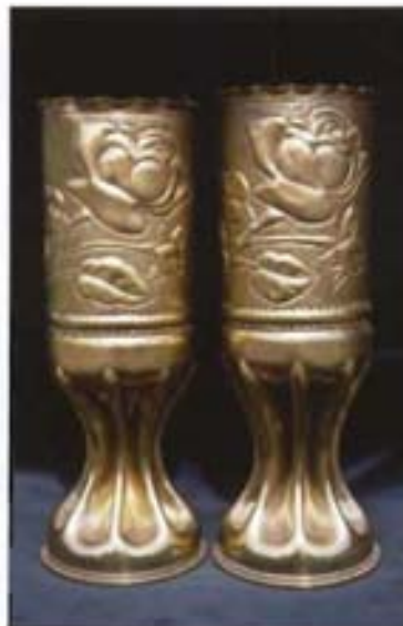
Colour plate 4 Pair of corseted trench-art artillery-shell-case vases, decorated with Art Nouveau roses (page 82). (Nicholas J Saunders)