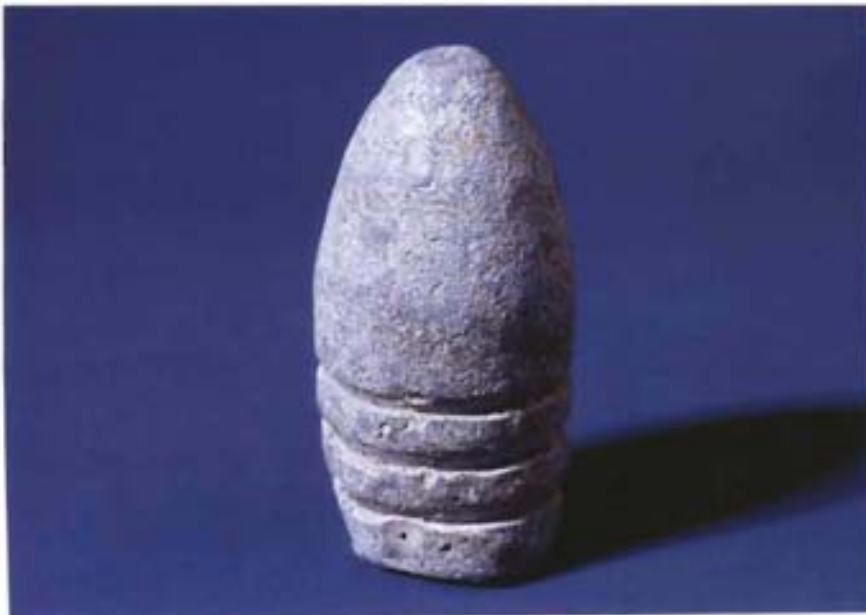
Colour plate 18 The Minié ball, a mid-nineteenth-century lead bullet with a hollow at one end (page 152). When fired in a rifle, the ball expanded to fit the grooves of the barrel and thus acquired a rapid spin, increasing accuracy. (National Museum of American History)