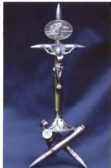
Colour plate 7 Bullet crucifix on a tripod of German Mauser bullets (page 88). The memorial plaque shows the Menin Gate Memorial to the Missing at Ypres, Belgium, and thus dates the piece to 1927 or later, indicating this was a postwar souvenir made for battlefield pilgrims and tourists.