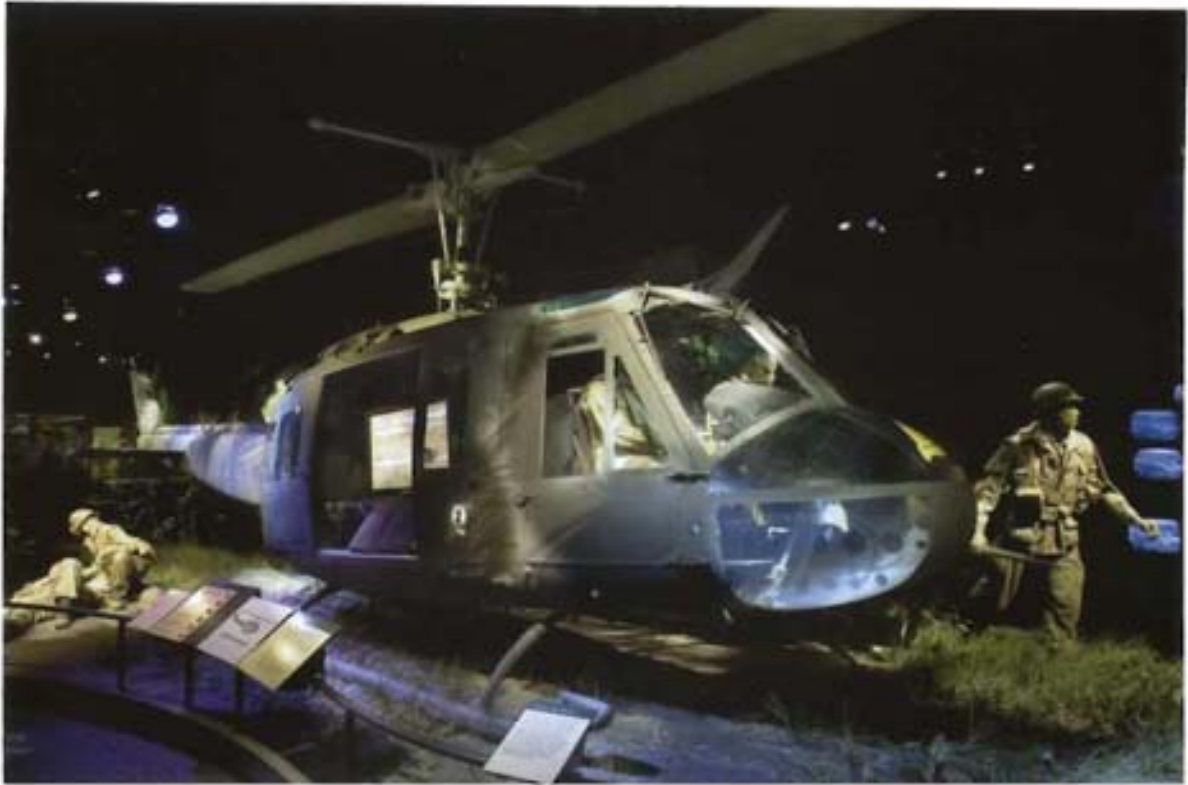
Colour plate 17 The Bell UH-1 'Huey' helicopter used in the Vietnam War, displayed in the NMAH exhibition 'The Price of Freedom: Americans at War' (pages 149, 156).