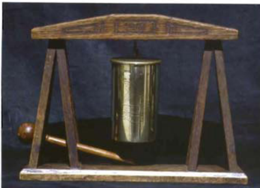
Colour plate 5 A post-war commemorative dinner gong made from a 75 mm artillery-shell case, decorated with the Sphinx, inscribed 'Egypt' and 'Lincolnshire', and mounted on a wooden frame engraved with '1919' (page 83). (Nicholas J Saunders)