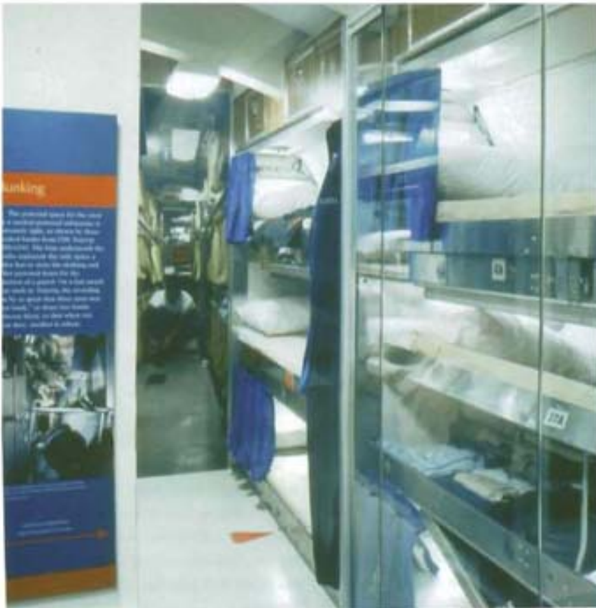
Colour plate 13 One exhibition theme was life aboard a nuclear-powered submarine on patrol, which often lasted many weeks without ever surfacing (page 145). One source of stress was the very cramped quarters, as this section of the USS Trepang's crew berthing in the exhibition shows.