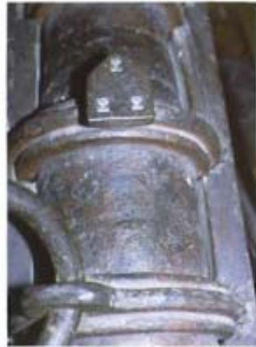
Colour plate 2 Gun barrel detail, showing marks. (Ruth Brown)