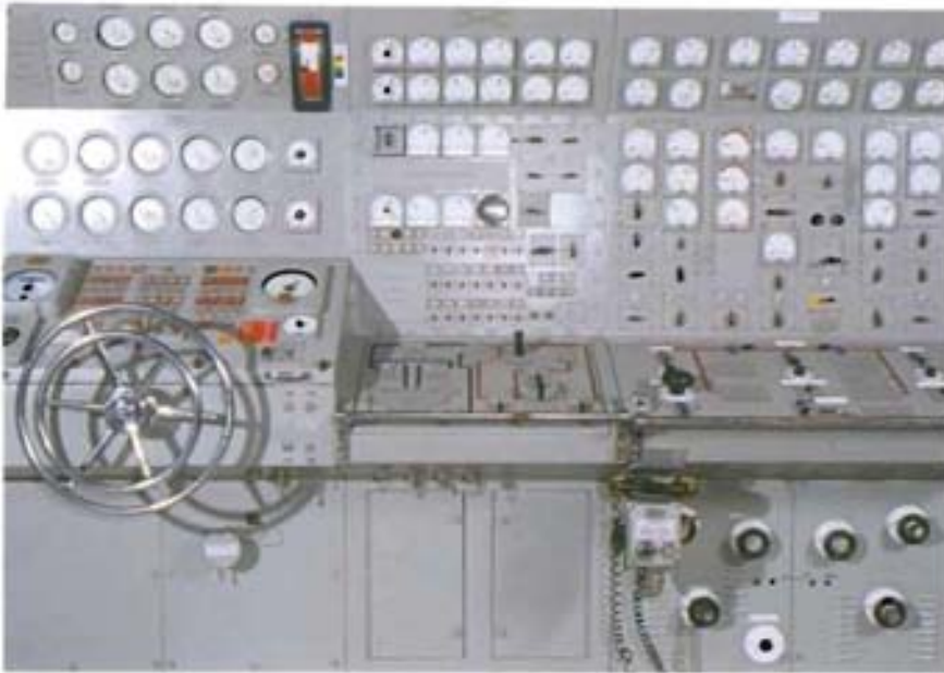
Colour plate 12 From left to right are the control panels for the submarine's steam turbines, nuclear reactor and electrical systems (page 144). These so-called manoeuvring-room consoles were seldom seen by most crew members and to the best of our knowledge have never before been displayed in public, albeit somewhat altered for security reasons.