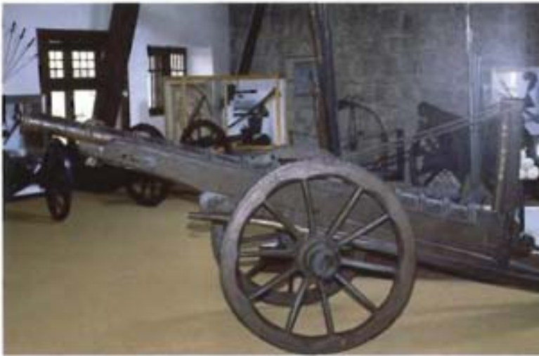
Colour plate 1 The gun barrel, dated to about 1470, shown in Figure 1, page 11. (Ruth Brown)