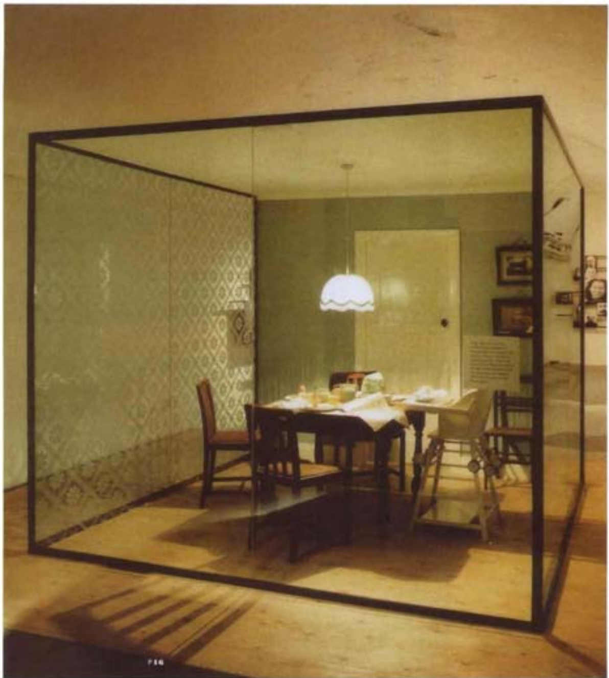
Colour plate 10 Interior of the Jersey War Tunnels visitor attraction in the Ho8 complex; a domestic scene from the 'Captive Island' installation (page 133).